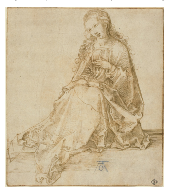
Albrecht Dürer, The Virgin Annunciate , 1495/1499, National Gallery of Art, Washington, Woodner Collection

Organized by the National Gallery of Art, Washington