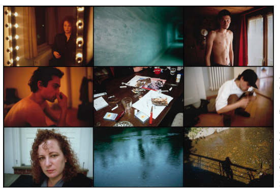
Nan Goldin, Relgpse/Detox Grid , 1998–2000, Corcoran Collection (Museum Purchase with Funds donated by the FRIENDS of the Corcoran Sallery of Art)