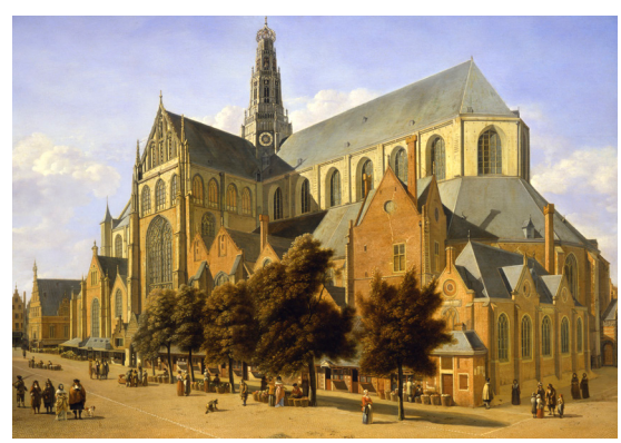
Gerit Berckheyde, The Grote Kerk or St. Bavokerk in Haarlem , 1666, Otto Naumann Ltd, New York