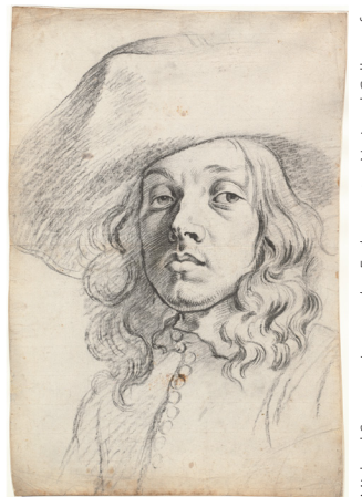
Michael Sweerts, Jan van den Enden , c. 1651, National Gallery of Art, Washington, New Century Fund

Organized by the National Gallery of Art, Washington