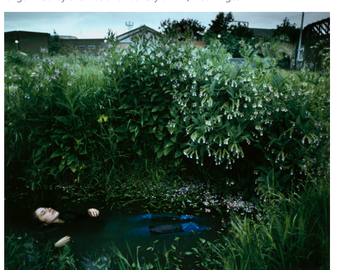
fom Hunter, The Way Home , 2000, National Gallery of Art, Gift of The Heather and Tony Podesta Collection

Organized by the National Gallery of Art, Washington