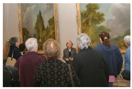
A Gallery educator leads a tour in ront of Jean-Honoré Fragonard's Daintings Blindman's Buff (c. 1775/1780) and The Swing (c. 1775/1780)

Download self-guided tours or participate in docent-led tours. Tours and gallery talks begin in the West Building Rotunda or at the East Building Information Desk.