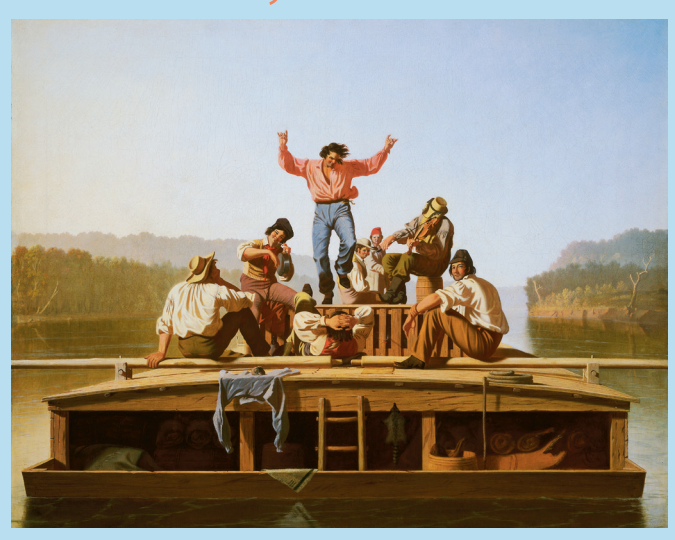
George Caleb Bingham, The Jolly Flatboatmen , 1846, National Gallery of Art, Washington, Patrons' Permanent Fund