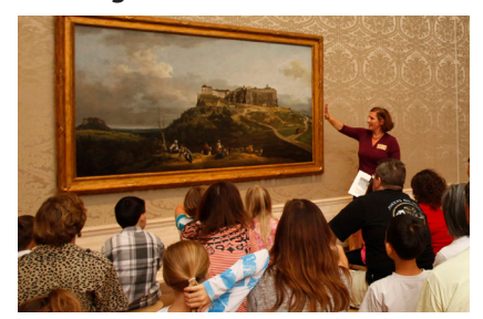
A Gallery educator leads a tour in front of Bernardo Bellottos 97 he Fortress of Königstein, 1756–1758, National Gallery of Art, Washington, Patrons' Permanent Fund.

Download self-guided tours or participate in a variety of docent-led tours. Tours and gallery talks begin in the West Building Rotunda or at East Building Information Desk.