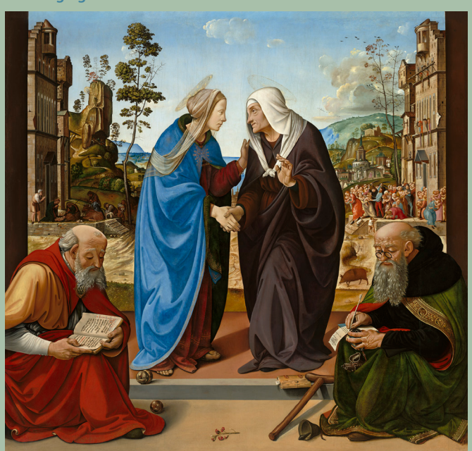
Piero di Cosimo, The Visitation with Saint Nicholas and Saint Anthony Abbot , c. 1489/1490, National Gallery of Art, Washington, Samuel H. Kress Collection