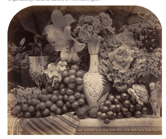
Roger Fenton, Fruit and Flowers , 1860, National Gallery of Art, Washington, Paul Mellon Fund

Organized by National Gallery of Art, Washington