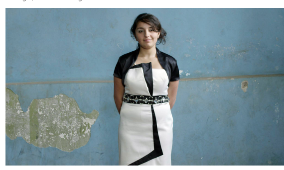
Still from The Machine That Makes Everything Disappear, to be shown as part of the series Discovering Georgian Cinema.

Organized in association with the Museum of Modern Art, Berkeley Art Museum, and Pacific Film Archive, with special thanks to the Andy Warhol Foundation for the Visual Arts, the Embassy of Georgia, and the Georgian National Film Center.