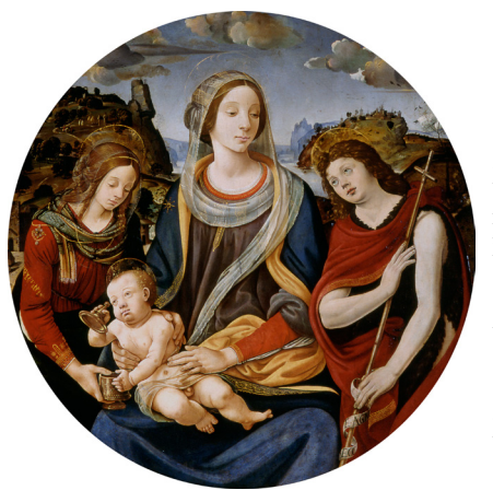
Piero di Cosimo, Madonna and Child with Saints Mary Magdalene and John the Baptist, c. 1495, Musée des Beaux-Arts, Strasbourg