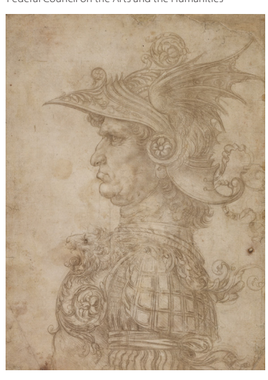
Leonardo da Vinci, A Bust of a Warrior, c. 1475/1 480, On loan from The British Museum, London

Organized by the National Gallery of Art, Washington in association with The British Museum, London / Made possible by a generous gift in memory of Melvin R. Seiden / The Exhibition Circle of the National Gallery of Art is also supporting the exhibition / Supported by an indemnity from the Federal Council on the Arts and the Humanities