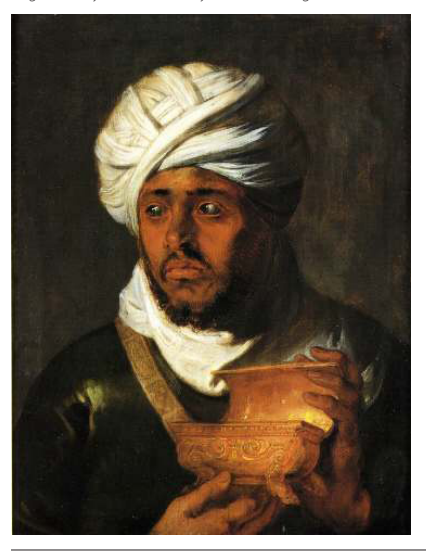
Peter Paul Rubens, One of the Three Magi (Balthasan) , c. 1618, Museum Plantin-Moretus, Antwerp – UNESCO World Heritage

Organized by National Gallery of Art, Washington