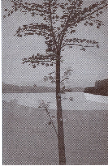
Alex Kat Nationa Gift of t

Illustrated books from the 1920s and 1930s by Max Ernst, a major figure in both the Dada and surrealist movements, are drawn from the rare book collection of the National Gallery of Art Library. The exhibition includes the classic collage novels La Femme 100 têtes (1929) and Une Semaine de Bonté