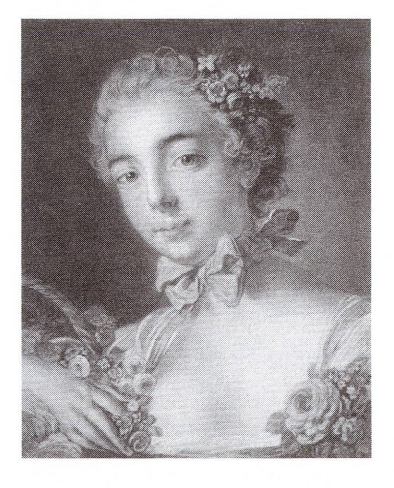
Louis-Marin Bonnet (after François Boucher), Tête de Flore (Head of Flora) , 1769

Hardcover exhibition catalogue: $65. Softcover exhibition catalogue: $49.95. To order, see last page.