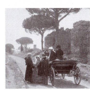
Film still from Fra Piazza del Poppolo Danish Film Institute, Copenhager

Check out our free self-guided postcard tours for families. Things That Walk, Talk, and Squawk and American Art Search are each available in Spanish and English and may be borrowed from the East Building and West Building main Art Information Desks.