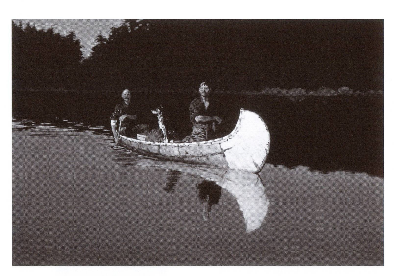
Frederic Remington, Evening on a Canadian Lake, 1905, Collection of William I. Koch, Palm Beach, Florida