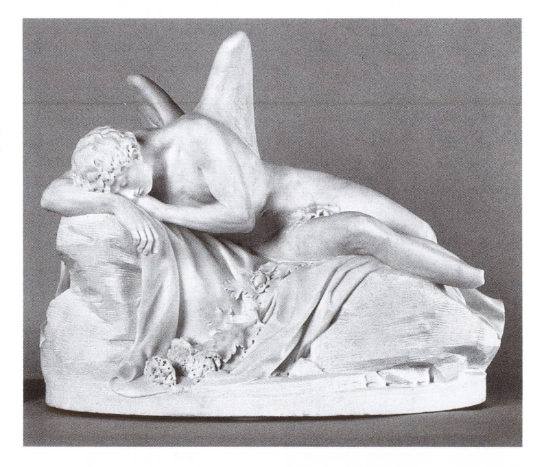
Jean-Antoine Houdon, Morpheus , dated 1777, Musée du Louvre, Département des Sculptures

The exhibition is supported by an indemnity from the Federal Council on the Arts and the Humanities.