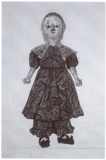
Molly Bodenstein, Doll , 1938, Index of American Design, National Gallery of Art

Selma Sandler, Partial Set of Nine Pins , 1935/1942, Index of American Design, National Gallery of Art