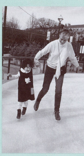
The National Gallery of Art Sculpture Garden ice skating rink. Photo by Dean