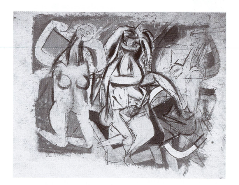
Willem de Kooning, Untitled , 1947, Private collection © 2002 Willem de Kooning Foundation/Artists Rights Society (ARS), New York

The exhibition was organized by the National Gallery of Art, Washington.