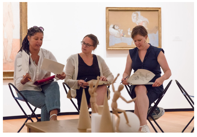
Visitors participate in a drawing salon in a gallery of modern art.

Advance registration required due to limited space Join us for sketching and conversation in the galleries. Led by practicing artists, these workshops use sketching as a way to slow down and look closely at works of art in the collection and exhibitions. Workshops are designed for all skill levels. View the complete schedule and reserve a space at nga.gov/drawingsalon. For more information, email drawingsalon@nga.gov.