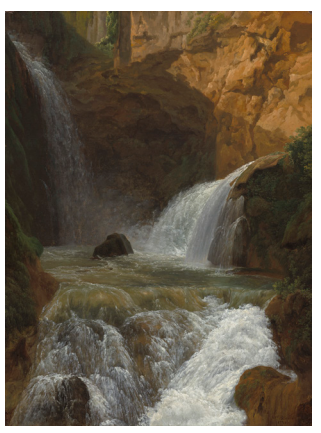
lean-Joseph-Xavier Bidauld, View of the Waterfalls at Twoli, 788, National Gallery of Art, Washington, Gift of Fern and George Wachter, 2005:140:1

Organized by the National Gallery of Art, Washington; the Fondation Custodia, Collection Frits Lugt, Paris; and the Fitzwilliam Museum, Cambridge