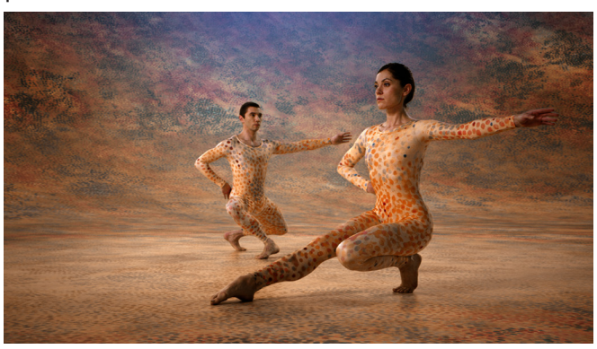
Still from Alla Kovgan's Cunningham (2019).

Groundbreaking choreographer Merce Cunningham (1919 – 2009) is the subject of Alla Kovgan's new documentary portrait.