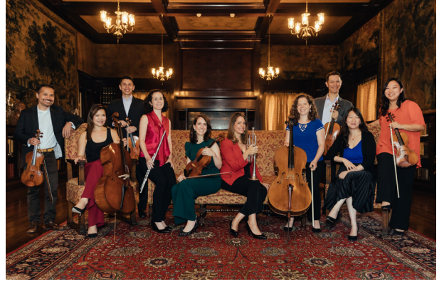
iound Impact.

In conjunction with Degas at the Opéra , this program uses a contemporary approach to represent an evening at the Paris Opéra in the 1870s and 1880s.