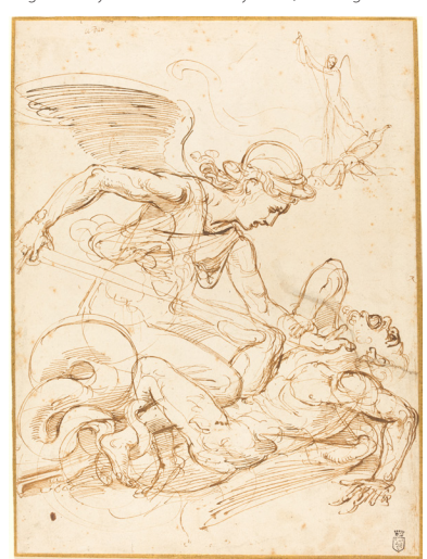
Giuliano Pippi, called Giulio Romano, S aint Michael, c. 1527 /1528, National Gallery of Art, Washington, Ailsa Mellon Bruce Fund, 1973.5.1

Organized by the National Gallery of Art, Washington