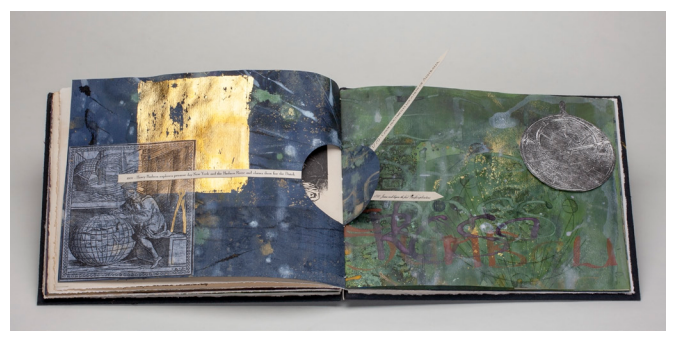
Lyndi Sales, The Ship (copy 4 of 6), Cape Town, 2000, National Gallery of Art Library, David K.E.

Organized by the National Gallery of Art, Washington