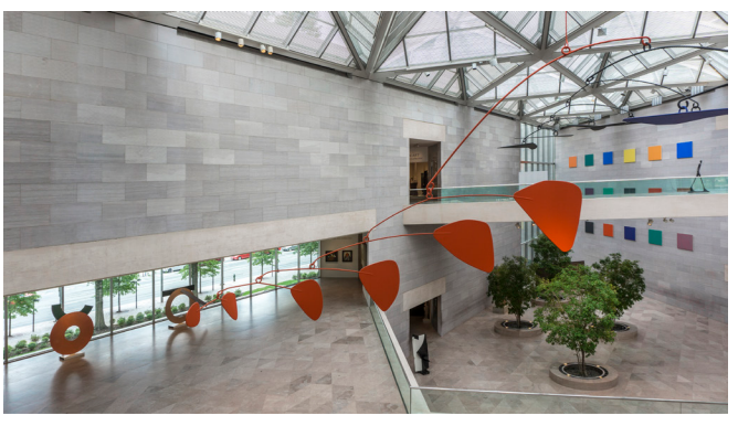
East Building Atrium, National Gallery of Art, Washington

The Gallery's Master Facilities Plan is an ongoing, phased approach to long-term repair, restoration, and renovation of the museum's landmark buildings. Having completed major renovations to the East Building in 2016, additional work has been underway since 2018 to improve select building systems and expand accessible entrances and restrooms. From late summer 2020 to summer 2021, the Atrium skylight will be modernized, which will include replacing its 23,000 square feet of glass.