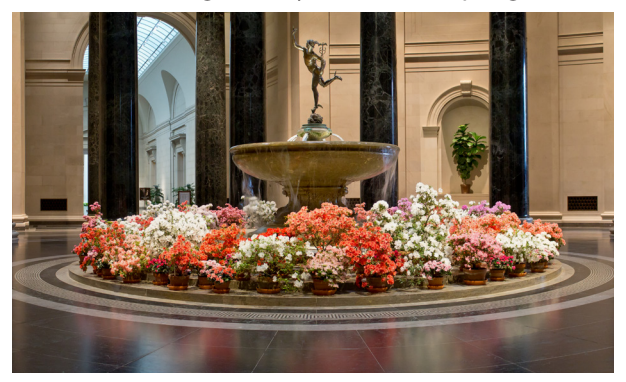
The 2019 Ames-Haskell Azalea Collection adorns the West Building Rotunda with color.

From November through April, floral displays of seasonal plants rotate in the West Building Rotunda. The Ames-Haskell Azalea Collection, given in honor of the Gallery's 50th anniversary in 1991, commemorates the Gallery's anniversary on March 17. On display throughout March, the azaleas are a great way to welcome spring.