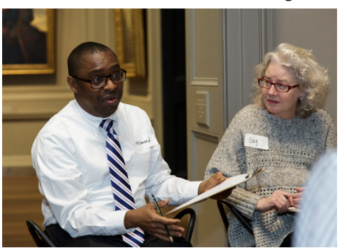
articipants take advantage of one of the

Tours with an emphasis on verbal description of the collections are offered twice a month; topics change monthly. The July tour begins in the West Building Rotunda. The June and August tours begin at the Information Desk in the East Building.