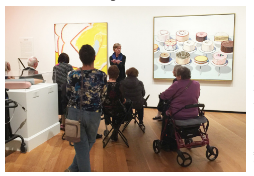
A Gallery educator leads a Picture This program n an installation of pop art in the East Buidling.

Tours with an emphasis on verbal description of the collections are offered twice a month; topics change monthly. The April tour begins at the Information Desk in the East Building Atrium. The March and May tours begin in the West Building Rotunda.