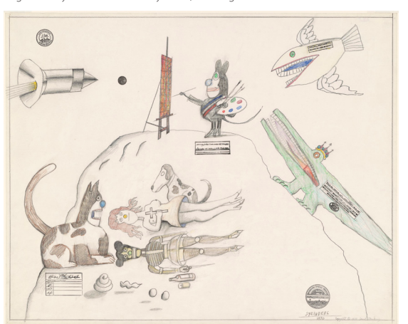
ةaul Steinberg, Artist, 197 0, National Gallery of Art, Washington, Sift of The Saul Steinberg Foundation

Organized by the National Gallery of Art, Washington