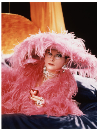
from Wittgenstein (1993), screening on March 31. Photo

Established in 1935, the BFI National Archive holds nearly one million titles from the earliest days of cinema to the present day. The five films in this program represent recent work in preservation and restoration.