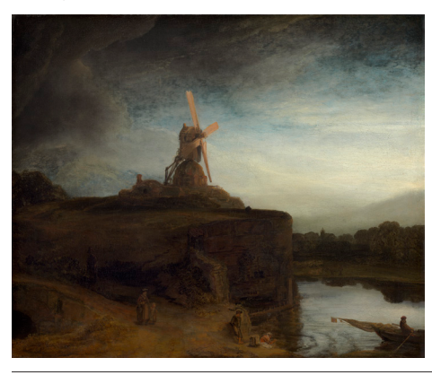
Rembrandt van Rijn, The Mill, 1645/1648, National Gallery of Art, Washington, Widener Collection

Presented in a kid-friendly, interactive style, highlights from the collection can be viewed at nga.gov/audio-video/video/kids.html.