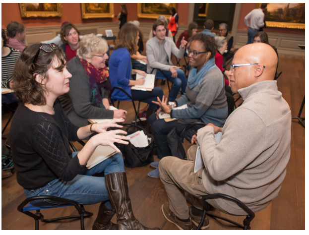
Participants collaborate during a Writing Salon workshop.

Construct short pieces of fiction that examine a critical moment in a narrative inspired by the work of Edward Hopper. Registration begins online at noon on April 3.