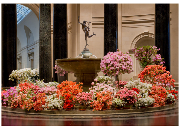
The 2017 Ames-Haskell Azalea Collection adorns the West Building's Rotunda with color.

Gardens were an important part of architect John Russell Pope's design concept for the West Building. The interior Garden Courts and exterior fountains emphasize and enhance the entrances. Changing floral displays include seasonal arrangements of flowering plants in the West Building Rotunda, such as the Ames-Haskell Azalea Collection, given in honor of the Gallery's 50th anniversary in 1991. The azaleas are shown each spring, usually for the entire month of March, to commemorate the Gallery's anniversary on March 17.