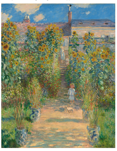
Claude Monet, The Artist's Garden at Vétheuil, 1880, National Gallery of Art Washington, Ailsa Mellon Bruce Collection

Made possible through the generous support of MSST Foundation.