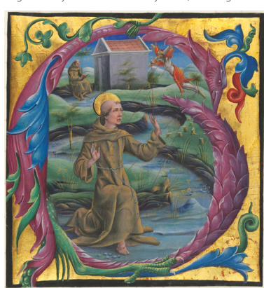
Losme Tura, Saint Francis Receiving the Stigmata, 1470s, National Gallery of Art, Washington, Rosenwald Collection

Organized by the National Gallery of Art, Washington