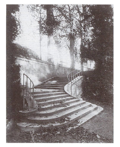
Eugéne Atget, The Steps at Saint-Cloud , 1906, National Gallery of Art, Anonymous Gift.