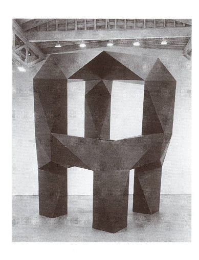
Tony Smith, Moondog, 1964/1998, Gift of The Morris and Gwendolyn Cafritz Foundation

The National Gallery of Art Sculpture Garden, given to the nation by The Morris and Gwendolyn Cafritz Foundation, opens to the public on May 23. Located in the 6.1-acre block adjacent to the West Building at Seventh Street and Constitution Avenue, NW, the garden provides an informal, yet elegant setting for some twenty works of sculpture, including important new acquisitions. A fountain, which serves as an ice rink during winter, and walking and seating areas offer visitors a chance to rest and reflect on the works on view. The refurbished Pavilion will offer year-round café service (beginning mid-summer 1999) along with indoor seating.