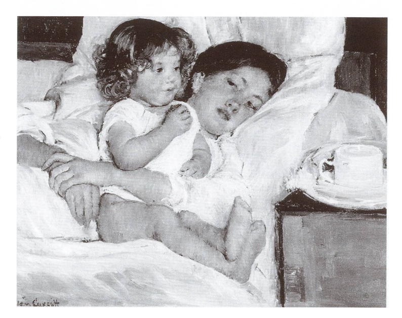
Mary Cassatt, Breakfast in Bed , c. 1897 The Virginia Steele Scott Collection, Huntington Library and Art Gallery, San Marino, California.

The exhibition is made possible through the generous support of