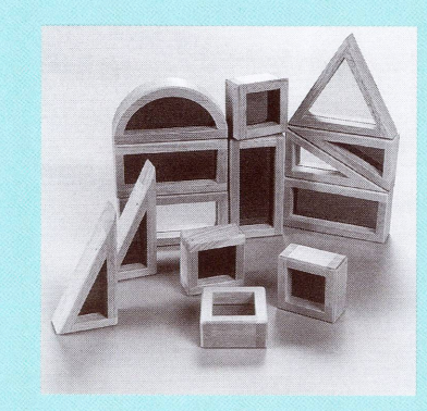
Colorful Rainbow Blocks from the Young Artists' Collection

Sales information: (202) 842-6466. Mail order: (301) 322-5900 or (800) 697-9350. You may also browse the Gallery Shops and make your purchases on the National Gallery of Art Web site at www.nga.gov.