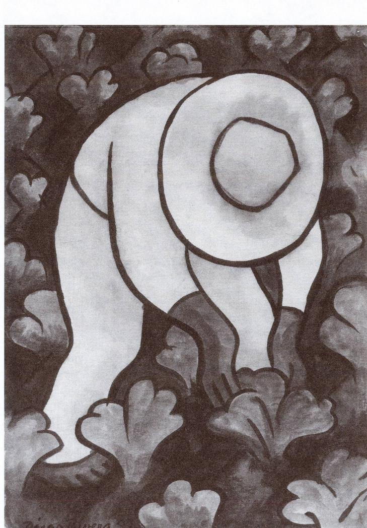
Diego Rivera, Man with Lettuce, 1937, The Judith Rothschild Foundation