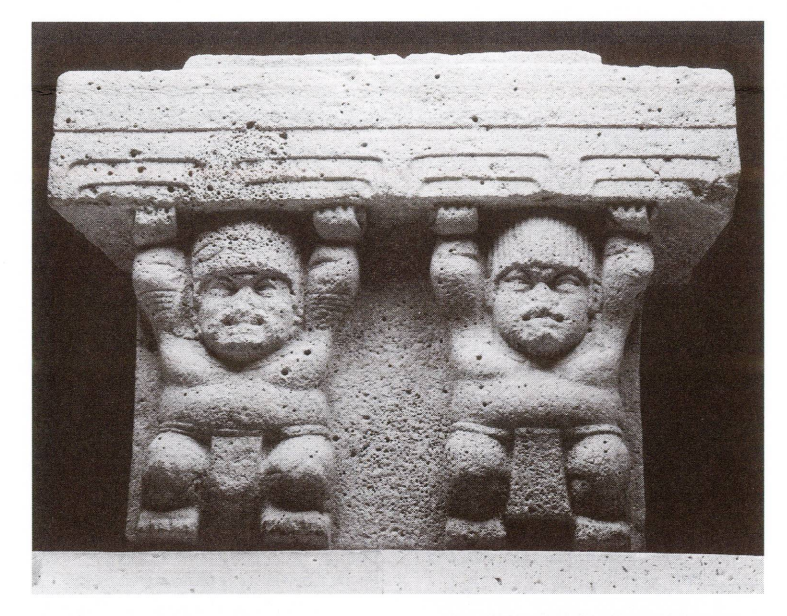
Potrero Nuevo Monument 2–4109 (Throne with Atlantean Figures), Early Formative Period, Museo de Antropología de Xalapa, Universidad Veracruzana

Throughout Washington this summer, the Mexican Cultural Institute will present a variety of activities, including dance and musical performances, lectures, and exhibitions relating to the exhibition Olmec Art of Ancient Mexico . For more information, call (202) 728-1628.