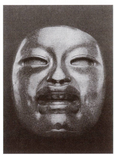
Maskette with Smiling Expression, Middle Formative Period, Museo Nacional de Antropología, Mexico City