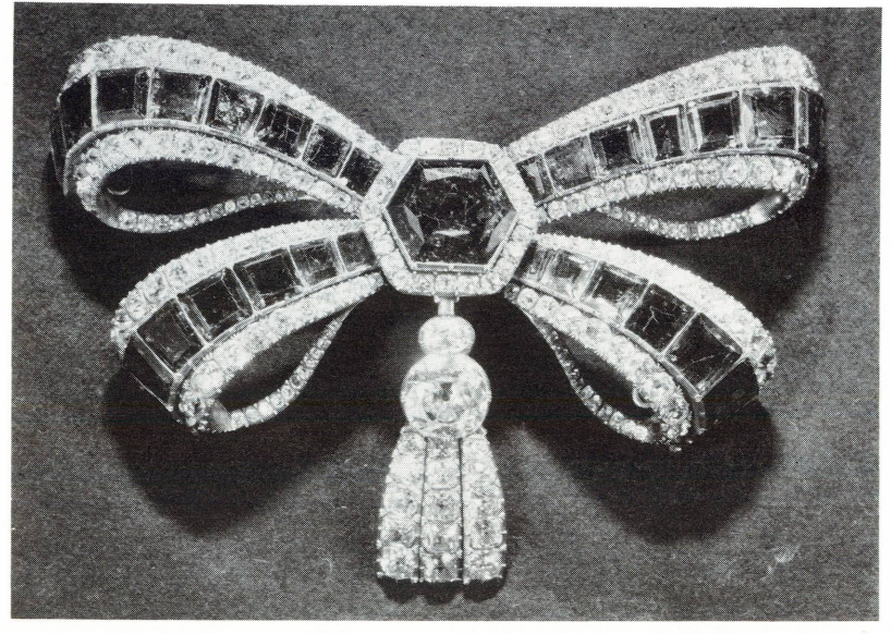
nymous, Corsage Brooch, first quarter 18th century. Palácio Nacional da

Early in the eighteenth century, discoveries of large deposits of gold, diamonds, and other precious stones in Brazil, then under Portuguese rule, ushered in a period of great prosperity in Portugal. These resources enabled the Portuguese crown and nobility to offer major commissions to the finest masters in Europe, as well as to support Portuguese artistic production at the highest level of quality. Other objects in the exhibition range from rarely seen silk vestments to unusual and beautiful scientific instruments from the University of Coimbra, as well as Portuguese and French table silver, elaborately carved and decorated