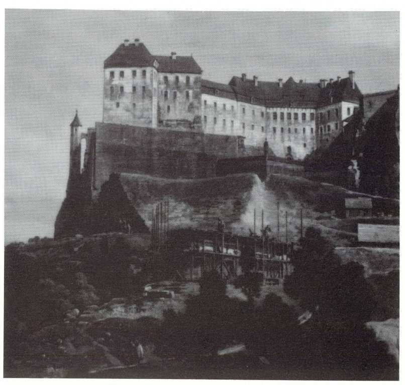
Bernardo Bellotto, The Fortress of Königstein (detail), 1756–1758. National Gallery of Art, Patrons' Permanent Fund

The National Gallery of Art has acquired a spectacular painting by the Italian master Bernardo Bellotto (1721-1780), one of the most original landscape and view painters in eighteenth-century Europe. The Fortress of Königstein (52 ½ x 92 ¾ inches), remarkable for its quality, size, and state of preservation, is one of five large views of an ancient fortress in the neighborhood of Dresden, commissioned from Bellotto by Augustus III, king of Poland and Elector of Saxony. It is a landscape painting of unrivaled scale and majesty both for the artist and for eighteenth-century European art and will heighten viewers' understanding of this artist's unique contribution to the genre. The new painting is installed together with four of the Gallery's view paintings by Canaletto, recently cleaned for the occasion. The Fortress of Königstein was acquired by the Gallery with income from its Patrons' Permanent Fund.