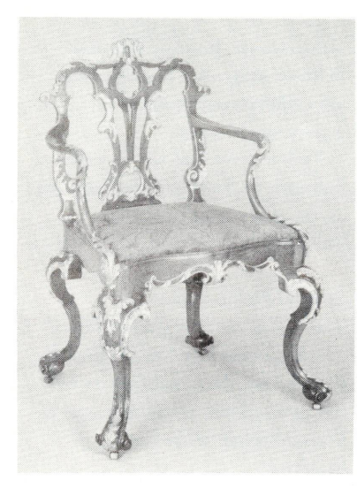
Portuguese, Armchair, third quarter eighteenth century. Private Collection, Lisbon

The symposium has been made possible by the Instituto Camões.