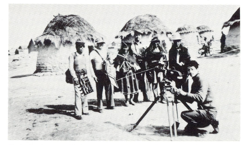
from La Cruz Gil (The Cross of the Gil), part of the series "Short Films from Latin America"

The American Documentary, part XII: The Form under Scrutiny (films