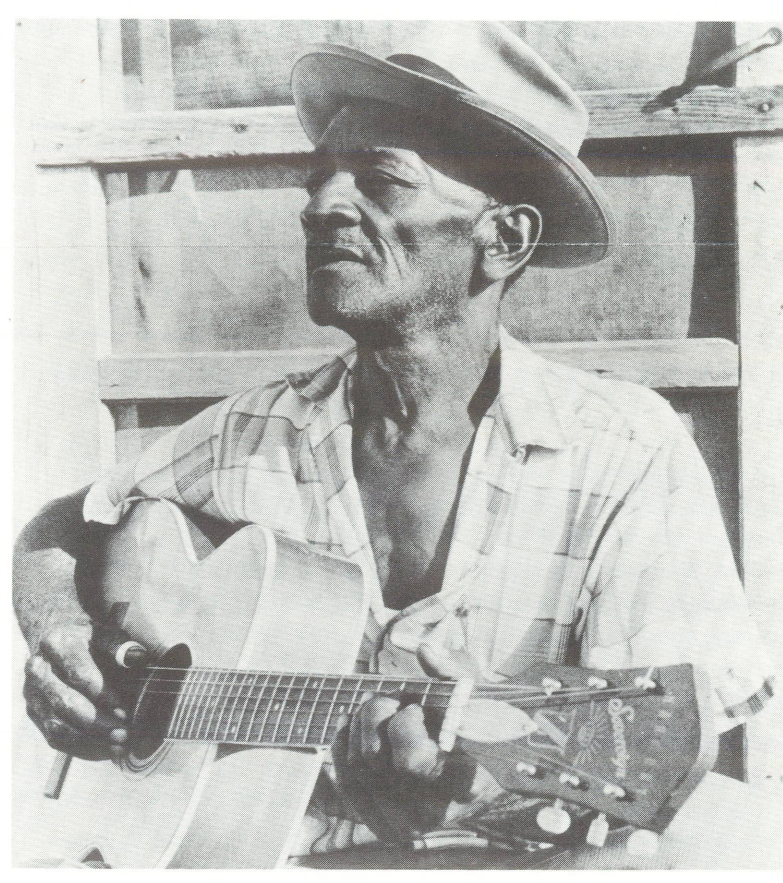
Manse Lipscomb, from A Well Spent Life, part of the series "The American Documentary"