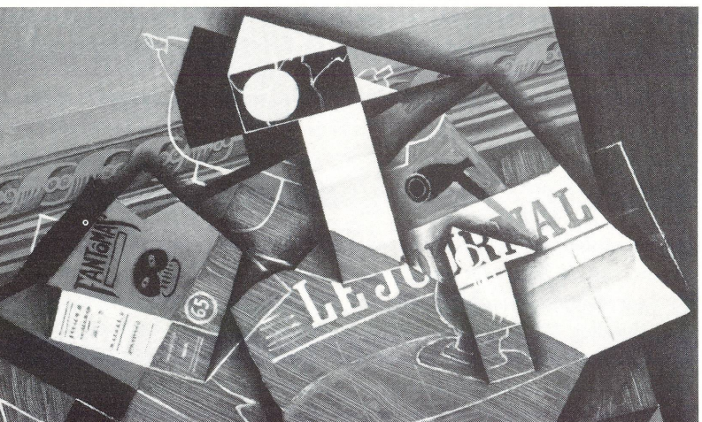
Juan Gris, Fantômas (detail), 1915. National Gallery of Art, Chester Dale Fund

Tours of the permanent collection and special exhibitions are available with a sign language interpreter for groups of five or more, and may be scheduled with four weeks notice. For adult groups, please call (202) 842-6247; for school groups call (202) 842-6249 or write to: Education Division, Tour Scheduling, National Gallery of Art, Washington, D.C. 20565. Include the type of tour you are requesting, two alternative dates and times, the number in your group, a contact person and an address. You will be notified in writing of the status of your request.