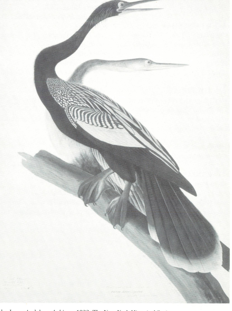
John James Audubon, Anhinga, 1822. The New-York Historical Society

The watercolors on view illustrate the range of Audubon's techniques and his development as an artist, from the early single profiles to his later animated portrayals of birds in their natural settings. The Birds of America, Audubon's mammoth set of 435 images, was begun in 1820 and followed to completion with the help of the London artist and printer Robert Havell, Jr., in 1838. The Birds of America, his magnum opus, is one of the greatest monuments in natural history as well as a multifaceted, beautiful work of art with nearly 1,000 birds illustrated in its final form.