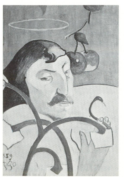
Paul Gauguin, Self-Portrait, 1889. National Gallery of Art. Chester Dale Collection

10:15 American Art Lecture Series: The Faces of America: Colonial Portraits 12:30 Film: Martin Chambi and the Heirs of the Incas 2:00 Film: The American Documentary: Revising the Past