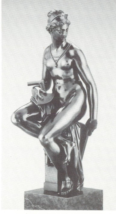
Giambologna, Architecture