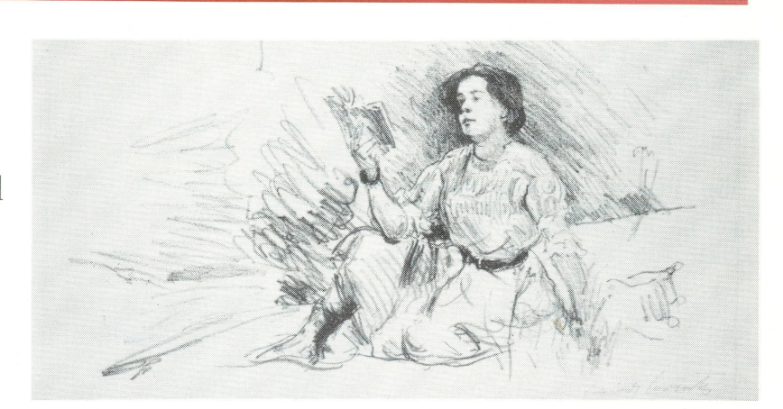
Lovis Corinth, Girl Reading, 1911. National Gallery of Art, Gift of the Marcy Family in memory of Sigbert H. Marcy

One of the most important figures in turn-of-the-century German art, Lovis Corinth (1858-1925) was a painter, draftsman, and accomplished printmaker, who worked in such varied media as etching, drypoint, lithography, and woodcut. This exhibition presents seventy-four of Corinth's prints and drawings, including many rare and extremely fine impressions. It celebrates the magnificent gift to the National Gallery of 134 works from the