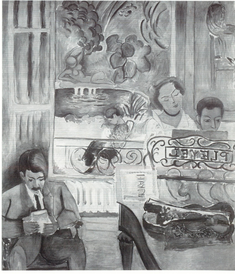
Henri Matisse, The Music Lesson (La Leçon de musique), 1917

Great French Paintings from The Barnes Foundation: Impressionist, Post-Impressionist, and Early Modern, on view at the Gallery through August 15, 1993, requires a pass. Same-day and advance passes may be obtained free of charge at the Gallery's East Building at Fourth Street and Constitution Avenue, N.W. Advance passes may also be obtained at all Ticketmaster locations and Hecht Co. stores for a service charge of $2.00 per pass. Through Ticketmaster PhoneCharge there is a $3.00 service fee per pass and a $1.00 handling fee per order. For this service please call one of the following numbers: Washington D.C. (202) 432-SEAT; Baltimore, MD (410) 481-SEAT; Nationwide Toll-Free (800) 551-SEAT. For more information on passes, call (202) 842-6713.