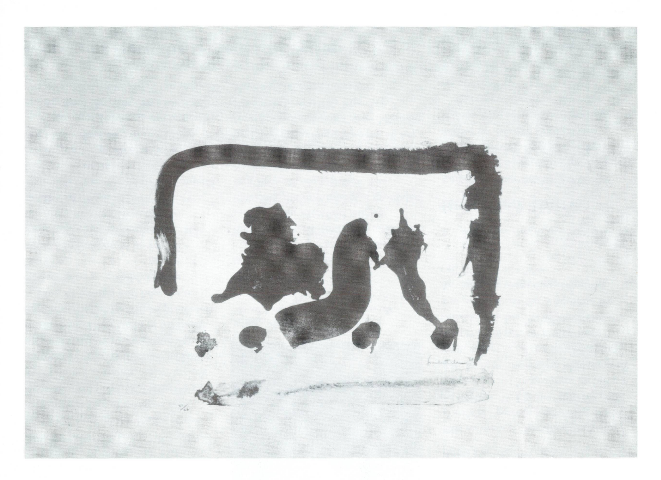
National Gallery of Art