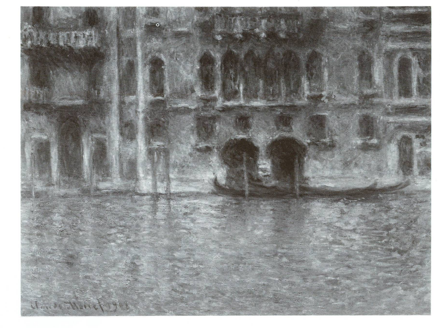
Claude Monet, Palazzo da Mula, Venice, 1908. National Gallery of Art, Chester Dale Collection