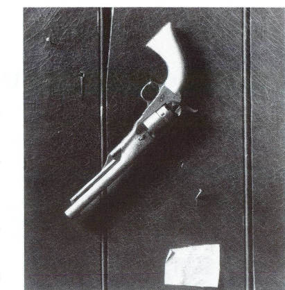
William M. Harnett, The Faithful Colt (detail), 1890, Wadsworth Atheneum, onnecticutt, The Ella Gallup Sumner and Mary Catlin Sumner Collection

late masterpieces as The Old Violin (1886), and represent all aspects of his endeavor. All four versions of the famous After the Hunt will be included, the first time this group has ever been shown together. The National Gallery is the final stop of the exhibition, which was organized by The Metropolitan Museum of Art, New York, the Amon Carter Museum, Fort Worth, and The Fine Arts Museums of San Francisco.