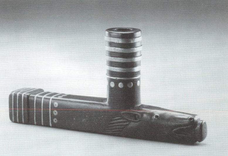
South Dakota (?), Sioux Pipe Bowl, c. 1870, The Detroit Institute of Arts, Museum Purchase with funds from the state of Michigan, the city of Detroit, and the Founders Society Detroit Institute of Arts

state of Michigan, and the Founders 1994).