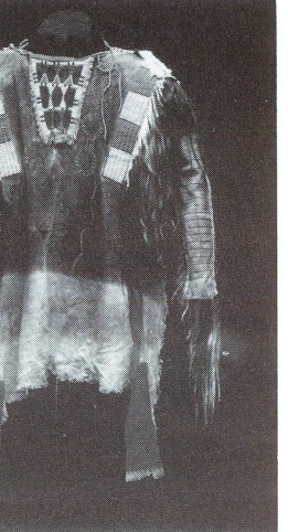
Montana, Northern Cheyenne Man's Shirt, c. 1860. Detroit Institute od Arts. Founders Society Purchase with funds from the Flint

Society Detroit Institute of Arts. After closing at the Gallery on January 24, 1993, the exhibition will travel to the Seattle Art Museum (March 11-May 9, 1993), the Buffalo Bill Historical Center (June 18–September 12, 1993), and the Detroit Institute of Arts (October 17, 1993-February 6,