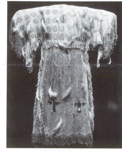
Oklahoma, Arapaho Dress, c. 1890, Buffalo Bill Historical Center, Cody, Wyoming, Chandler-Pohrt Collection

Art of the American Indian Frontier features a wide range of decorative, utilitarian, and ceremonial objects, including feather headdresses; moccasins; leather and textiles; beadwork; domestic items such as cradles, trunks, bowls, and spoons; pipes; weaponry; and pictographic engravings and drawings. The exhibition is divided into two