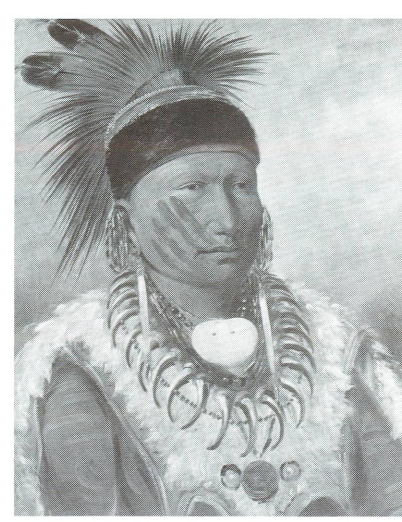
George Catlin. The White Cloud, Head Chief of the Iowas. 1844/1845, National Gallery of Art. Paul Mellon Collection

10:15 Survey Course: American Art: The 19th Century 12:30 Film: Alice Neel: Collector of 1:00 Gallery Talk: Mythological Themes in NGA Paintings