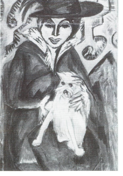
Ernst Ludwig Kirchner, Woman with Dog\ I , 1912, Ludwig and Rosy Fischer Collection

The prints on display come from the collection of the National Gallery, while the paintings and drawings include not only works belonging to