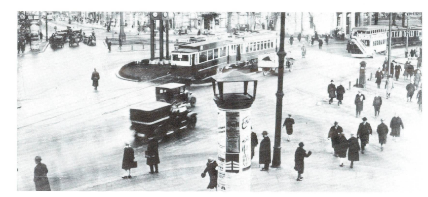
Berlin, Symphony of a City Walther Ruttmann