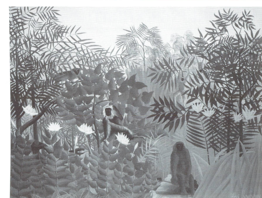
Henri Rousseau, Tropical Forest with Monkeys, dated 1910, National Gallery of Art, John Hay

12:00 Gallery Talk: The Victorian View of Renaissance Art 12:30 Film: The Stations of Bach