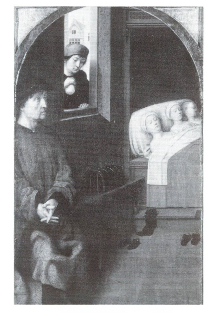
Gerard David, Saint Nicholas Slips a Purse Through the Window of an Impoverished Nobleman, c. 1511, National Galleries of Scotland, Edinburgh