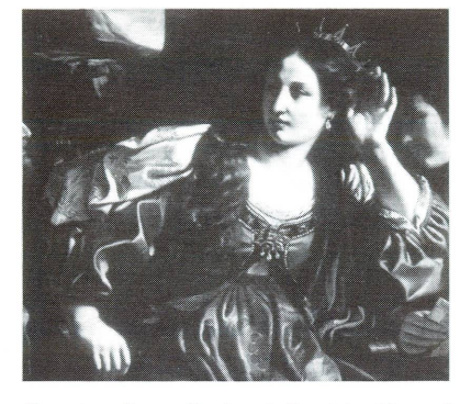
Guercino, Queen Semiramis Receiving News of the Revolt of Babylon (detail), 1624, Museum of Fine Arts, Boston, Francis Welch Fund

*For information on hotels in Wilmington, please call the Delaware Art Museum, (302) 571-9590. Wilmington is served by the Amtrak rail line.