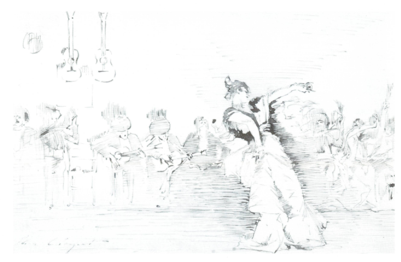
John Singer Sargent, Sketch\ after\ El\ Jaleo,\ 1882, Private Collection

reduced version of the exhibition will be on view at the Isabella Stewart Gardner Museum, September 10 through November 22, 1992.