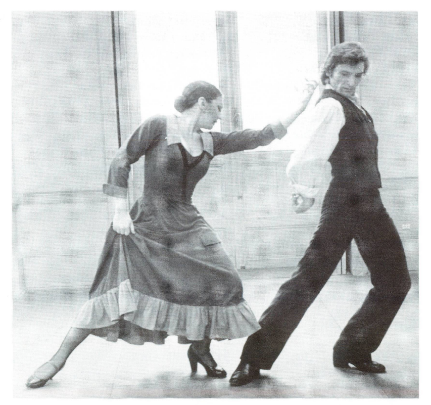
Blood Wedding, Carlos Saura

Victoria and Albert (BBC, 1977, 60 minutes); April 8 through 11 at 12:30, April 9 at 1:30, April 12 at 1:00