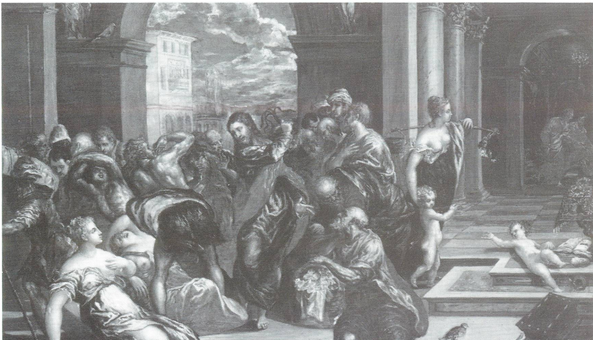
El Greco, Christ Cleansing the Temple (detail), probably before 1570, National Gallery of Art, Samuel H. Kress Collection

12:00 Gallery Talk: "Woman with Pompons" by Jean Dubuffet