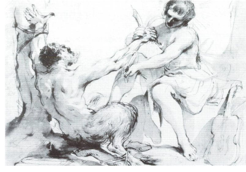
Guercino, Apollo Flaying Marsyas, 1618. Copyright Her Majesty Queen Elizabeth II, Royal Library, Windsor Castle

The exhibition catalogue was written by Nicholas Turner, deputy keeper in the department of prints and drawings in the British Museum The exhibition was curated for the