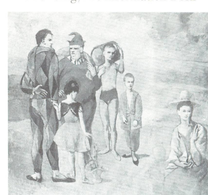
Pablo Picasso, Family of Saltimbanques, 1905. National Gallery of Art, Chester Dale Collection

Monday through Friday 11:30; Saturday 11:00; Sunday 2:00 East Building, Art Information Desk