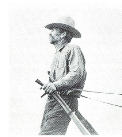
The Plow That Broke the Plains, 1936

Recorded tours are $3.50; $3.00 for senior citizens, students, and