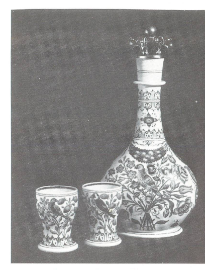
Bottle and two tumblers, 1730–1735, The Corning Museum of Glass

1:00 Gallery Talk: Rubens in Italy 2:30 Film: Street Scenes