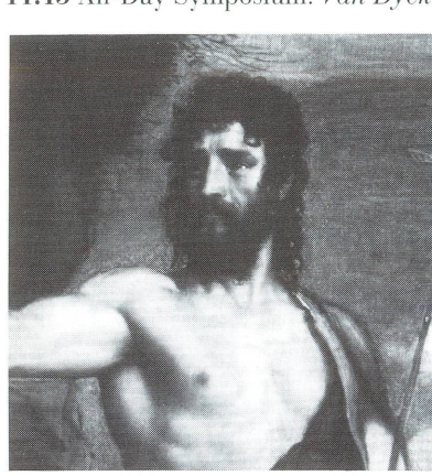
Titian, Saint John the Baptist (detail), 1542, Gallerie dell'Accademia, Venice

10:15 Survey Course: The Middle Ages: Late Medieval Art 11:15 All-Day Symposium: Van Dyck