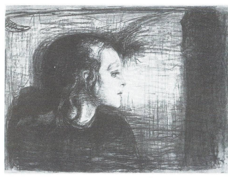
Edvard Munch, The Sick Child, 1896, Epstein Family Collection