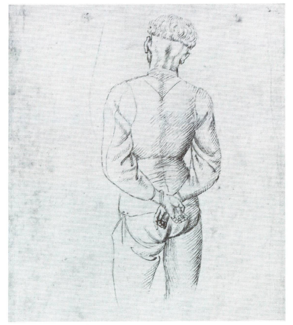
Antonio Pisanello, View of a Young Man with His Hands behind His Back, c. 1433, The National Galleries of Scotland, Edinburgh

George Caleb Bingham is made possible in Washington by Hecht's, a division of The May Department Stores Company, and by Monsanto Company. A fully illustrated catalogue published by The Saint Louis Art Museum in association with Harry N. Abrams, Inc. accompanies the exhibition. The show has been organized by The Saint Louis Art Museum, in association with the National Gallery of Art and is supported in part by a grant from the National Endowment for the Arts and the Humanities. Research for the exhibition and catalogue was funded by The Henry Luce Foundation, Inc.