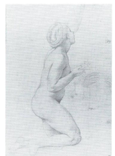
Raphael, A Nude Woman Kneeling with Her Left Arm Raised, c. 1518, The National Galleries of Scotland, Edinburgh