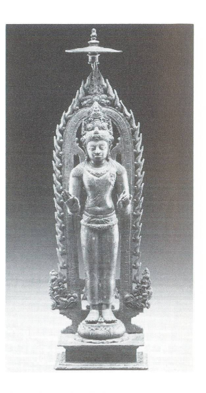
Standing Avalokitesvara, Central Java, 9th century, Museum Nasional, Jakarta