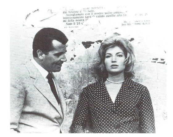
L'Avventura, 1960, directed by Michelangelo Antonioni, to be shown August 4

The East Building will close at 6:00 p.m. on Sundays, but the Fourth Street entrance will remain open only for film audiences