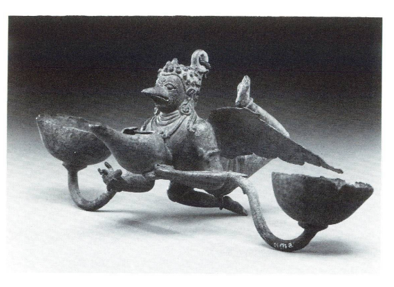
Hanging Lamp, 9th-10th century, Museum Nasional, Jakarta

The accompanying fully illustrated catalogue includes entries on the objects, essays by Dr. Fontein and Indonesian scholars R. Soekmono and Edi Sedyawati, and color photographs of monument sites. After closing at the National Gallery on November 4, the show will travel to the Museum of Fine Arts, Houston, December 9, 1990 through March 17, 1991; The Metropolitan Museum of Art, New York, April 27 through August 18, 1991; and the Asian Art Museum, San Francisco, September 28, 1991 through January 5, 1992. Organized by the National Gallery of Art, the exhibition is made possible by a grant from Mobil Corporation and is supported by an