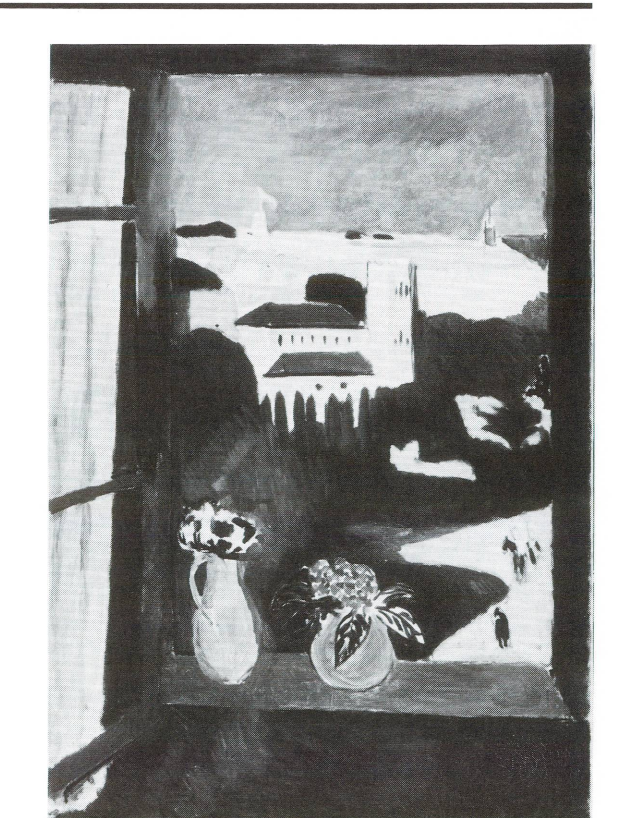
Henri Matisse, Landscape Viewed from a Window, 1912/1913. State Pushkin Museum of Fine Arts. Moscow