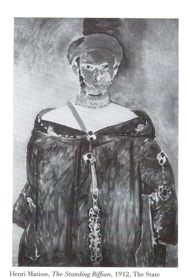
Hermitage Museum, Leningrad

Pass System: On crowded weekdays and weekends, free passes will be distributed if necessary on a first-come, first-served basis. Passes are for specified half-hour entry times and may be obtained at the special exhibition desk located on the ground floor of the East Building. Current pass information for the exhibition is available by calling (202) 842-3472.