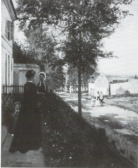
Camille Pissarro, Road from Versailles to Louveciennes 1870, Foundation E. G. Bührle Collection

The exhibition is organized by the Foundation E. G. Bührle Collection, Zurich, and the National Gallery of Art. A fully