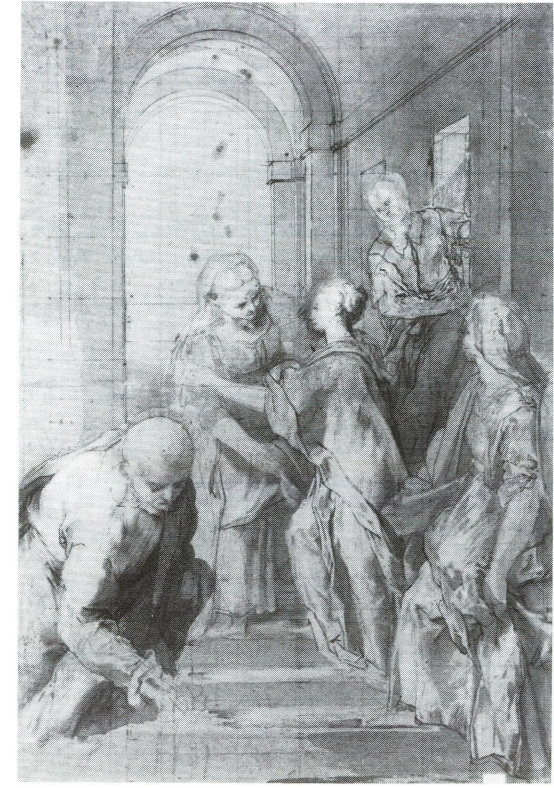
Federico Barocci, The Visitation , c. 1583, The National Galleries of Scotland, Edinburgh