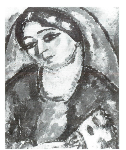
Alexej von Jawlensky, The Red Veil (detail) 1912, Thyssen-Bornemisza Collection