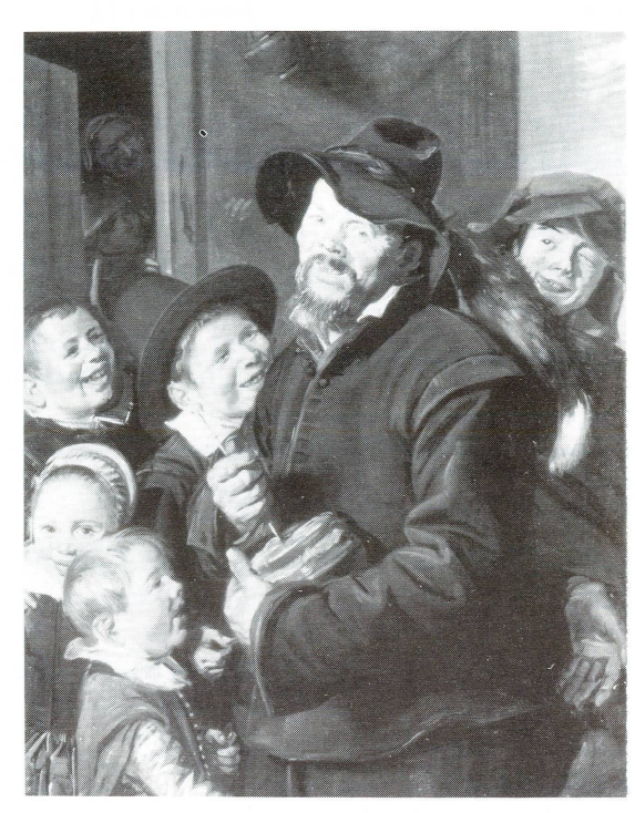
Frans Hals, The Rommel Pot Player, c. 1618–1622, Kimbell Art Museum, Fort Worth

Italian Etchers was organized by the Museum of Fine Arts, Boston, where it premiered, and traveled to the Cleveland Museum of Art before coming to the Gallery. The exhibition and catalogue in Boston were made possible by Fabriano Paper Mill, Italy. Generous funding has also been provided by the National Endowment for the Arts. The exhibition at the National Gallery is made possible by Mellon Bank.