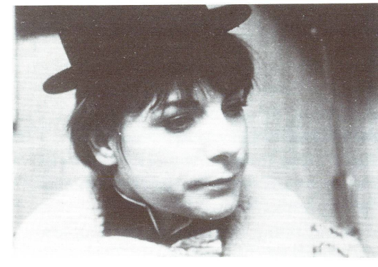
Artists Under the Big Top: Perplexed, Alexander Kluge, 1967, to be shown October 22