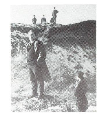
Alexander Kluge, 1976, to be shown October 28

Please see the reverse side for dates and times.