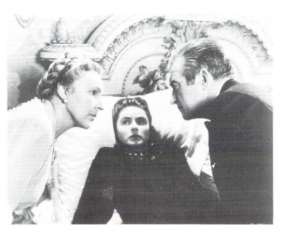
Notorious, Alfred Hitchcock, 1946, to be shown September 16