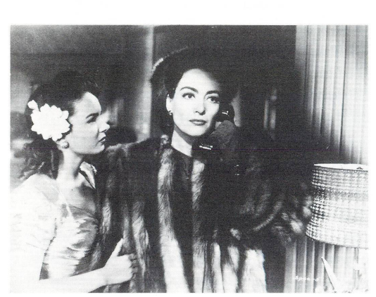
Mildred Pierce, Michael Curtiz, 1945, to be shown September 9