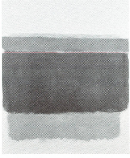
Mark Rothko, Untitled, 1949, National Gallery of Art, Gift of The Mark Rothko Foundation

Two publications have been produced by the National Gallery in conjunction with the exhibition. The installation is made possible by a grant from American Express Company.