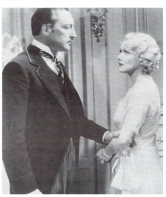
Madame X, 1937, directed by Sam Wood, to be shown August 20