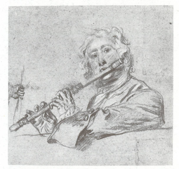
Antoine Watteau, A Man Playing a Flute, c. 1706-c. 1716, The Fitzwilliam Museum, Cambridge

After leaving the National Gallery, the exhibition will be presented at the Kimbell Art Museum, Fort Worth (July 15-Oct. 8, 1989), the National Academy of Design in New York (Nov. 5, 1989-Jan. 28, 1990), The