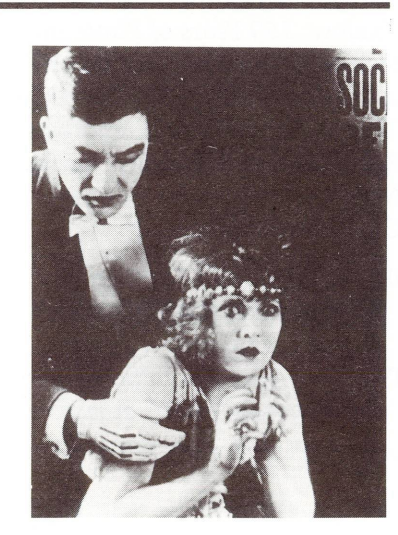
The Cheat, 1915, directed by Cecil B. DeMille, to be shown June \scriptstyle\rm II

Strike (Sergei Eisenstein, 1925, 97 min., silent) Sun. 6:00