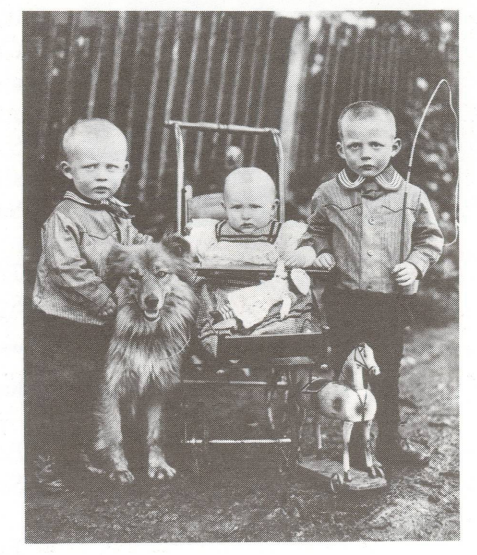
August Sander, Group of Children , Westerwald , 1920, J. Paul Getty Museum

The exhibition, organized chronologically, is divided into four sections—The Pencil of Nature (1839-1879), The Curious Contagion of the Camera (1880-1918), Ephemeral Truths (1919-1945), and Beyond the Photographic Frame (1946-present). It is accompanied by a fully-illustrated catalogue. Following its Washington venue the show will travel to The Art Institute of Chicago, September 16-November 26, 1989, and the