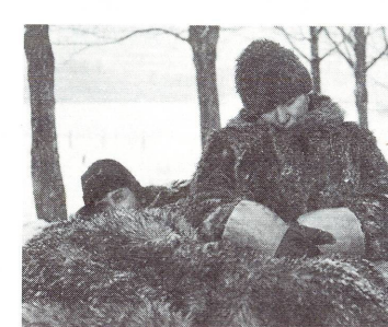
Mon oncle Antoine, 1971, by Claude Jutra, to be shown April 23

Mon oncle Antoine (Claude Jutra, Canada, 1971, 104 min., subtitled) Sun. 6:00