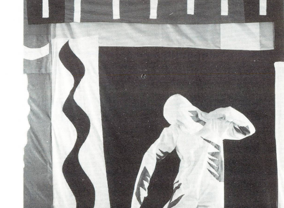
Matisse's Circus, performed by the Amherst Ballet Theatre Co