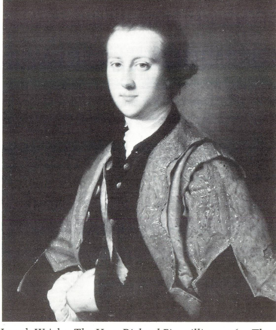
Joseph Wright, The Hon. Richard Fitzwilliam, 1764, The Fitzwilliam Museum, Cambridge

Organized by the National Gallery of Art, Washington, and the National Gallery of Canada, Ottawa, this is the first collaborative exhibition between the two museums and the first time many of these drawings have been on view in the United States. A fully-illustrated catalogue will accompany the exhibition, which is made possible by Canada's Belzberg family.