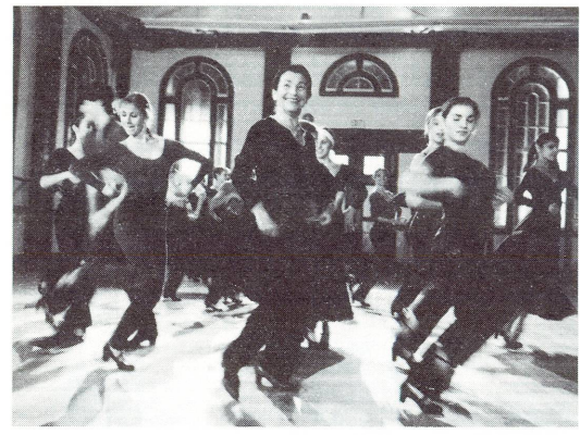
Flamenco at 5:15, National Film Board of Canada, 1983, to be shown April 19 and 23

Free films on art and feature films related to special exhibitions. Unreserved seats are available on a first-come, first-served basis. East Building Auditorium