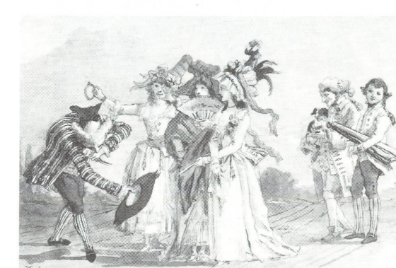
Tiepolo, An Encounter during a Country Walk, c. 1791, National Gallery of Canada, Ottawa

Fifteen nineteenth- and twentieth-century drawings are on view in a reinstallation of master drawings from The Armand Hammer Collection. As part of a series of rotating temporary exhibitions from the collection, these drawings are exhibited in the graphics galleries in the West Building. Included in the selection are two important recent acquisitions, a large, romantic mountain scene by David Cox, and the beautiful Ariadne by Sir Edward Coley Burne-Jones.