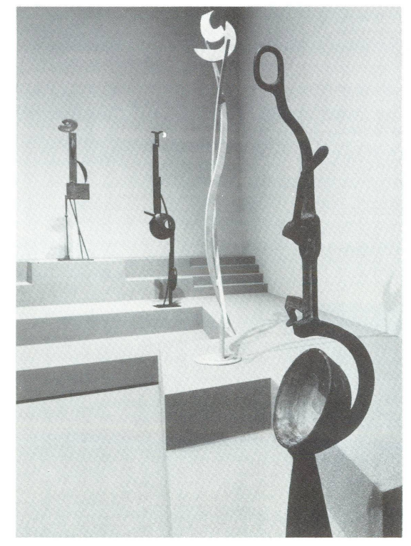
Installation of David Smith sculpture in East Building Tower

Two publications will be produced by the National Gallery in conjunction with the exhibition. One book, made possible by The Charles E. Smith Companies and The Artery Organization, will profile the architecture of the East Building and highlights of its ten-