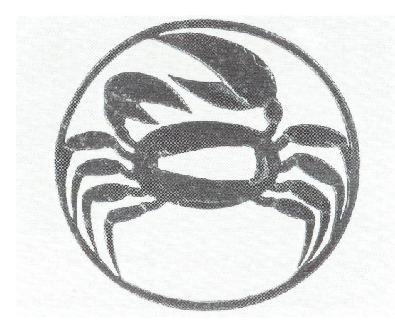
Tsuba with crab, 16th century, Tokyo National Museum

A new half-hour film produced by the National Gallery, Daimyo , is being shown in the East Building Small Auditorium, Monday through Saturday, hourly beginning at II:00 with the final showing at 4:00; Sundays, hourly from I:00 to 6:00. Support for this film has been provided by Tobishima Corporation. Seating will be on a first-come, first-served basis, with no reservations required.