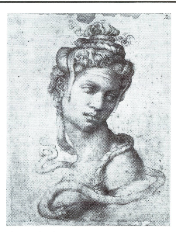
Michelangelo, Cleopatra, Casa Buonarroti

In addition, an authentic Japanese tea house and garden has been constructed in the East Building. Members of the public have an opportunity to participate in a tea