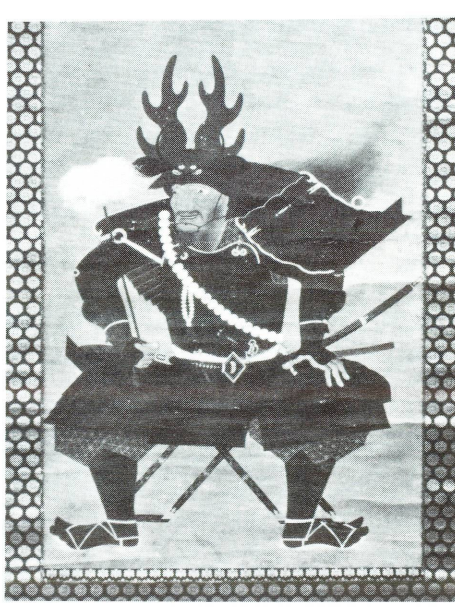
Portrait of Honda Tadakatsu (detail), early 17th century, Honda Takayuki Collection, Tokyo