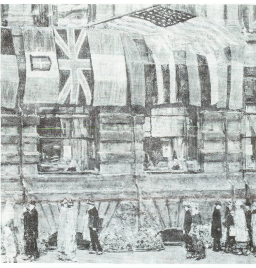
Childe Hassam, Allied Flags , April 1917 (detail), Kennedy Galleries, New York