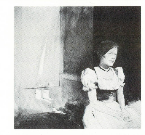
Andrew Wyeth, Peasant Dress, 1972