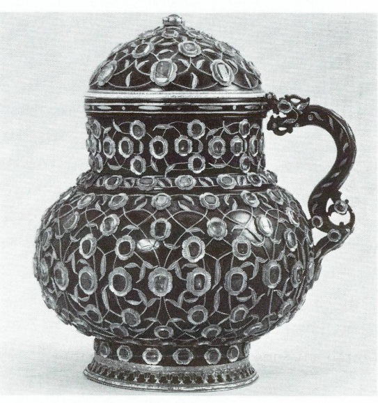
Jeweled black stone jug with lid, second half 16th century Topkapı Palace Museum, Istanbul

history of the Sultan's reign, illuminated copies of his collected poems, and personal items including Süleyman's caftans and swords.