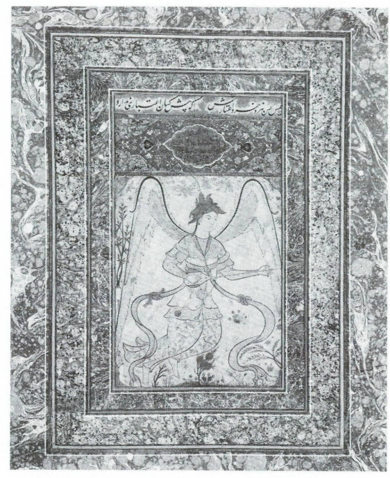
Peri with a lute from an album, mid-16th century Topkapı Palace Museum, Istanbul

The exhibition presents the highest aesthetic and technical achievement of the Ottoman Empire during the reign of Sultan Süleyman I (1520-1566). Known in Turkey as Kanuni, or "Lawgiver," in reference to his exemplary judicial acts which contributed to many Western constitutional laws, the sultan was a renowned legislator, statesman, poet, and generous patron of the arts. Highlighted are such Turkish national treasures as an inlaid wooden throne, a unique map of the Americas made in 1513, the illustrated