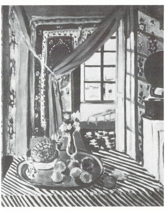
Matisse, Interior with Phonograph, 1924 Private Collection

Pass System. On most days, passes will not be needed to enter the exhibition. When the exhibition becomes crowded, free passes will be distributed on a first-come, firstserved basis. Passes will be for specified halfhour entry times and may be obtained at the special exhibition desk on the Ground Floor of the East Building. There are no advance reservations.