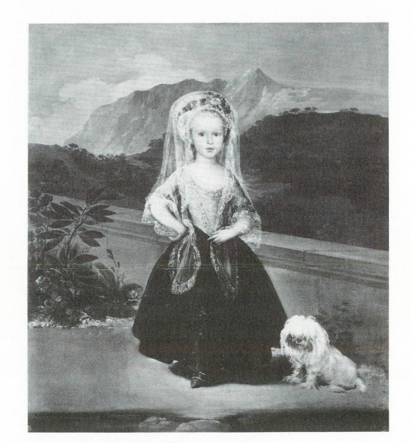
Goya, Condesa de Chinchón, 1783 National Gallery of Art, Ailsa Mellon Bruce Collection

The exhibition will travel to the Tel Aviv Museum (March 12-June 13, 1987) and is supported by an indemnity from the Federal Council on the Arts and the Humanities.