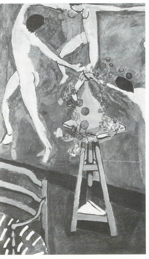
Henri Matisse, Nasturtiums with "La Danse," 1912 Pushkin Museum of Fine Arts, Moscow (inv. no. 3301)