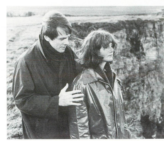
The Lacemaker, by Claude Goretta, to be shown May 17

Continuing through June, a free 12-week film and lecture series on Saturday afternoons will explore the ways in which painting has influenced the making of narrative motion pictures. Particular attention is given to the methods by which filmmakers have chosen their subjects and managed the visual effects of their films to reflect painterly values. Included are movies such as Claude Goretta's The Lacemaker, which were inspired by specific works of art. Programs last approximately two hours unless otherwise noted. See other side for information concerning the films to be shown during May.