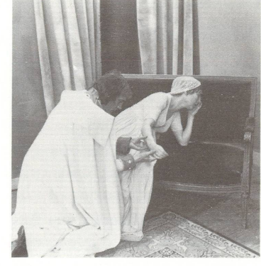
The Marquise of O, by Eric Rohmer, to be shown May 24

The Marquise of O. (by Eric Rohmer, 1976, 102 min.) Sat. 2:30