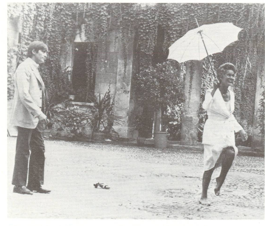
The Spider's Stratagem, by Bernardo Bertolucci, to be shown May 10

Free films on art and feature films related to special exhibitions. Unreserved seats are available on a first-come, first-seated basis. East Building Auditorium