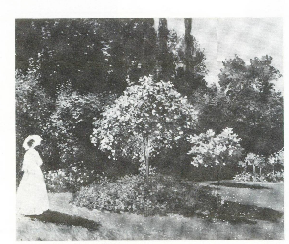
Claude Monet, Woman in a Garden, 1866 Hermitage Museum, Leningrad (inv. no. 6505)

As the first major art exchange to result from the cultural agreement signed in Geneva in November 1985, an exhibition of 40 impressionist, post-impressionist, and early modern paintings from the Soviet Union's Hermitage and Pushkin museums will be on view in the Concourse of the East Building. Most of these paintings have never been shown before in the United States.