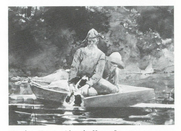
Winslow Homer, After the Hunt, 1892 Los Angeles County Museum of Art, Paul Rodman Mabury Collection