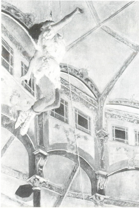
Edgar Degas, Miss Lola at the Cirque Fernando, 1879

Until March 2I, the National Gallery of Art continues to offer a free, thirty-minute orientation slide lecture on The New Painting: Impressionism 1874-1886. It is given Monday through Friday at II:00 a.m. in the West Building Lecture Hall (Auditorium). Seating is limited each day to a maximum of 100 people. No advance registration.