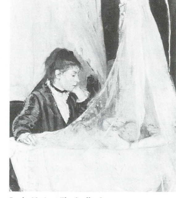
Berthe Morisot, The Cradle , 1872 Musée d'Orsay (Galerie du Jeu de Paume), Paris

For recorded information about the exhibition, call 202/842-6699.