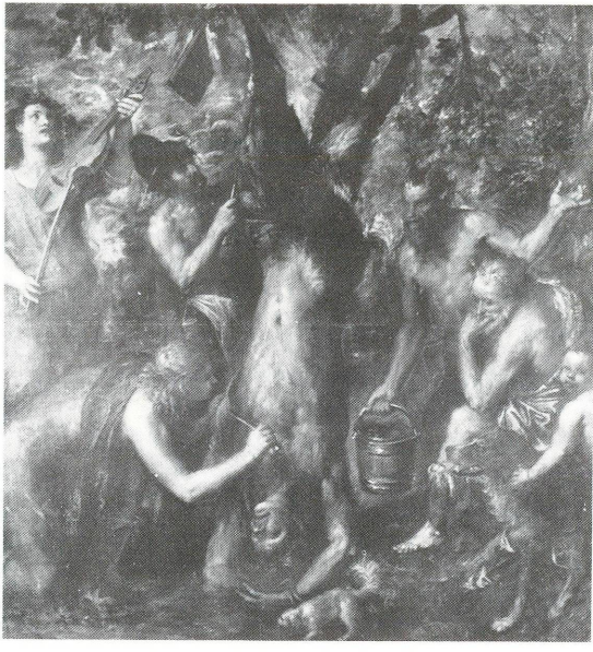
Titian, The Flaying of Marsyas The State Museum, Kromėříž, Czechoslovakia

On loan from the State Castle in Kroměříž, Czechoslovakia, to the United States for the first time, Titian's masterpiece The Flaying of Marsyas remains on view in the National Gallery's West Building Lobby A. Painted sometime between 1570 and the year of the artist's death in 1576, the picture is widely regarded as one of Titian's greatest works. The painting, portraying the legend of Apollo and Marsyas, graphically depicts Apollo, the winner of a musical contest, flaying the unfortunate loser, the live satyr Marsyas.