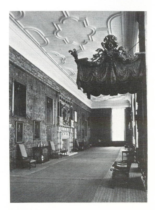
Hardwick Hall, Derbyshire

Saturday, 2:30-4:00 p.m. East Building Auditorium