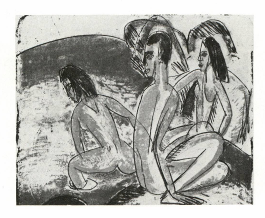
KIRCHNER. Three Bathers by Stones The Ruth and Jacob Kainen Collection

Drawings spanning the fifteenth to the twentieth centuries are on view in this exhibition selected from the collection of Curtis O. Baer. The exhibition is presented in four sections: Italian, fifteenth to eighteenth centuries; German, Flemish, and Dutch, sixteenth to eighteenth centuries; French, sixteenth to nineteenth centuries; and modern European. Artists represented include Titian, Rubens, Rembrandt, Watteau, David, Degas, and Picasso. The exhibition has been organized by the High Museum of Art, Atlanta.