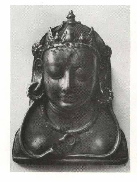
Mask (Himachael Pradesh) Museum für Indische Kunst, West Berlin