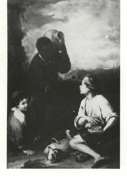
MURILLO. Two Peasant Boys and a Negro Boy Dulwich Picture Gallery, London