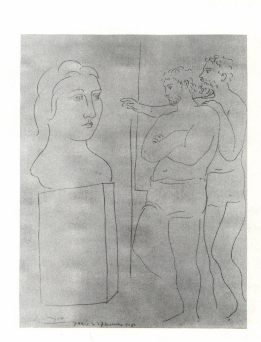
PICASSO. Two Men Contemplating a Bust of a Woman's Head The Curtis O. Baer Collection, High Museum of Art, Atlanta

One hundred drawings from the Curtis O. Baer Collection are on view, including works by such artists as Titian, Rubens, Rembrandt, Watteau, David, Degas, and Picasso. This is the first extensive public showing of the collection in almost thirty years. The collection was begun by Curtis O. Baer in Germany in the 1940s and is considered to be one of the finest drawing collections still in private hands. The exhibition has been organized by the High Museum of Art, Atlanta.