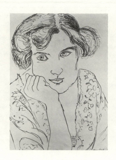
MATISSE. Head of a Young Woman High Museum of Art, Atlanta The Curtis O. Baer Collection

More than forty paintings from the National Gallery's Garbisch Collection.