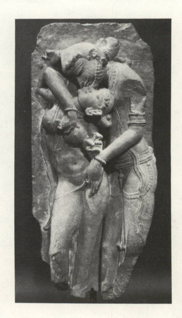
Lovers (Mithuna) The Cleveland Museum of Art Purchase from the Leonard C. Hanna, Jr. Bequest

Two recently discovered sculptural pillars and their three crossbars have been added to the exhibition, which opened on May 5. The new archaeological finds were first exhibited on the occasion of Prime Minister Rajiv Gandhi's visit on June 12. These objects join the other sculptural works of stone, ivory, and bronze in the exhibition, which is one of the artistic events in the year-long Festival of India.