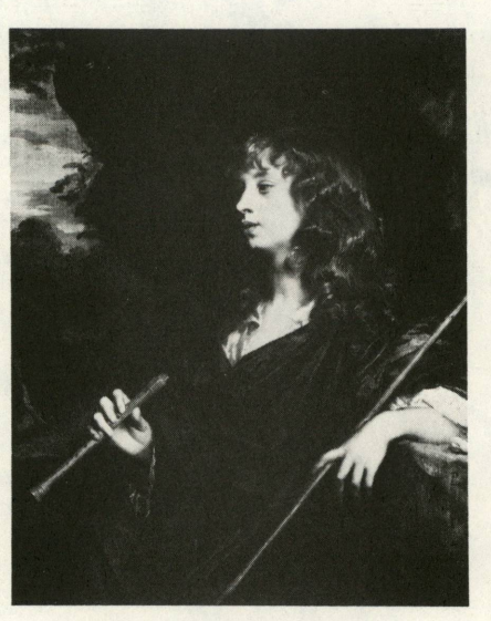
LELY. A Young Man as a Shepherd Dulwich Picture Gallery, London