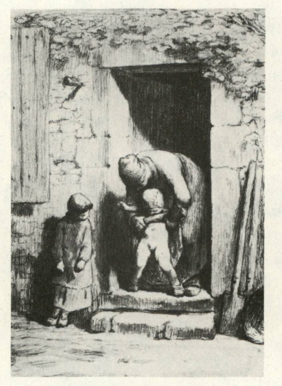
MILLET. Motherly Attentions Museum of Fine Arts, Budapest

One hundred drawings from one of the most exceptional private drawing collections in America go on view at the National Gallery. The Baer family collection is comprised of several hundred sheets from the fifteenth to the twentieth century. Titian's Satyr Family in a Landscape, Rubens' Head of Hercules, Rembrandt's Matchmaker, and Matisse's Portrait of a Woman are many of the major drawings to be seen in this exhibition, which has been organized by the High Museum of Art, Atlanta.