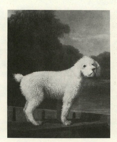
STUBBS. White Poodle in a Punt Paul Mellon Collection, Upperville, Virginia