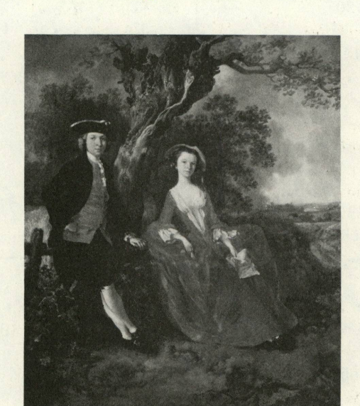
GAINSBOROUGH. An Unknown Couple in a Landscape Dulwich Picture Gallery, London